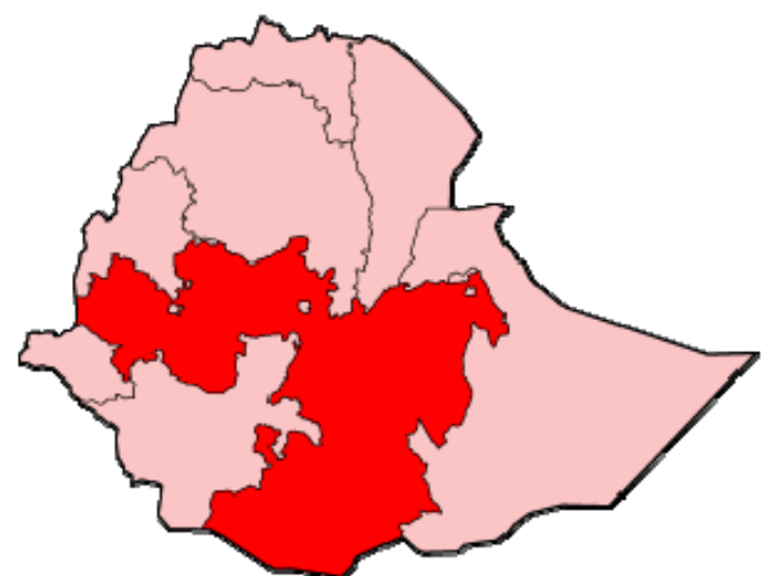
Map of Ethiopia showing Oromia State